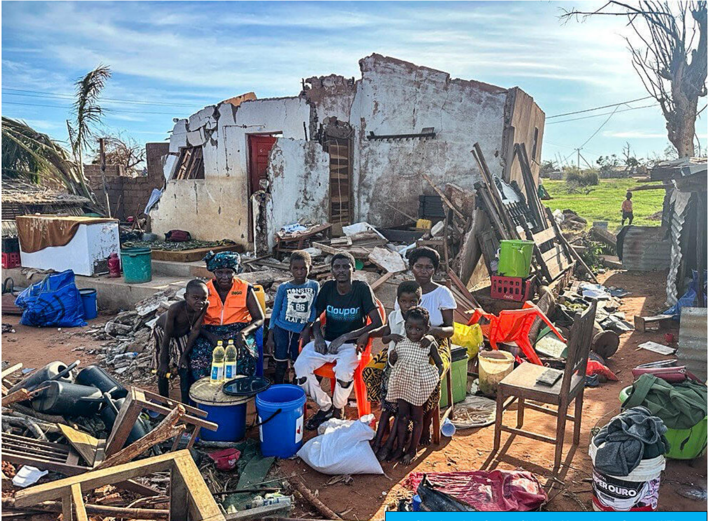
Situation of the Cyclone Chido in Mozambique

Africa, likely exacerbated by climate change. The storm's destruction has not only claimed lives but also left thousands displaced and at heightened risk of disease outbreaks, food insecurity, and economic instability. Immediate humanitarian relief has been crucial in addressing urgent needs, but the ongoing challenges, such as blocked roads and damaged communication networks, highlight gaps in disaster preparedness. Progressively, addressing the impacts of Cyclone Chido will require a multifaceted approach. Rebuilding efforts must incorporate climate resilience to mitigate the effects of future cyclones.